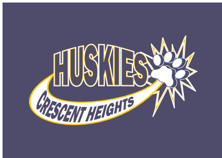
Screen Printed Logo